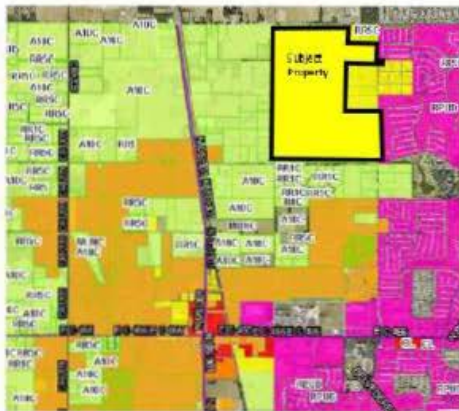
Proposed Future Land Use Designations